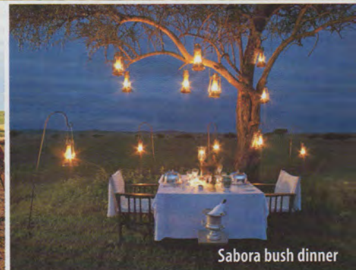
Sabora bush dinner