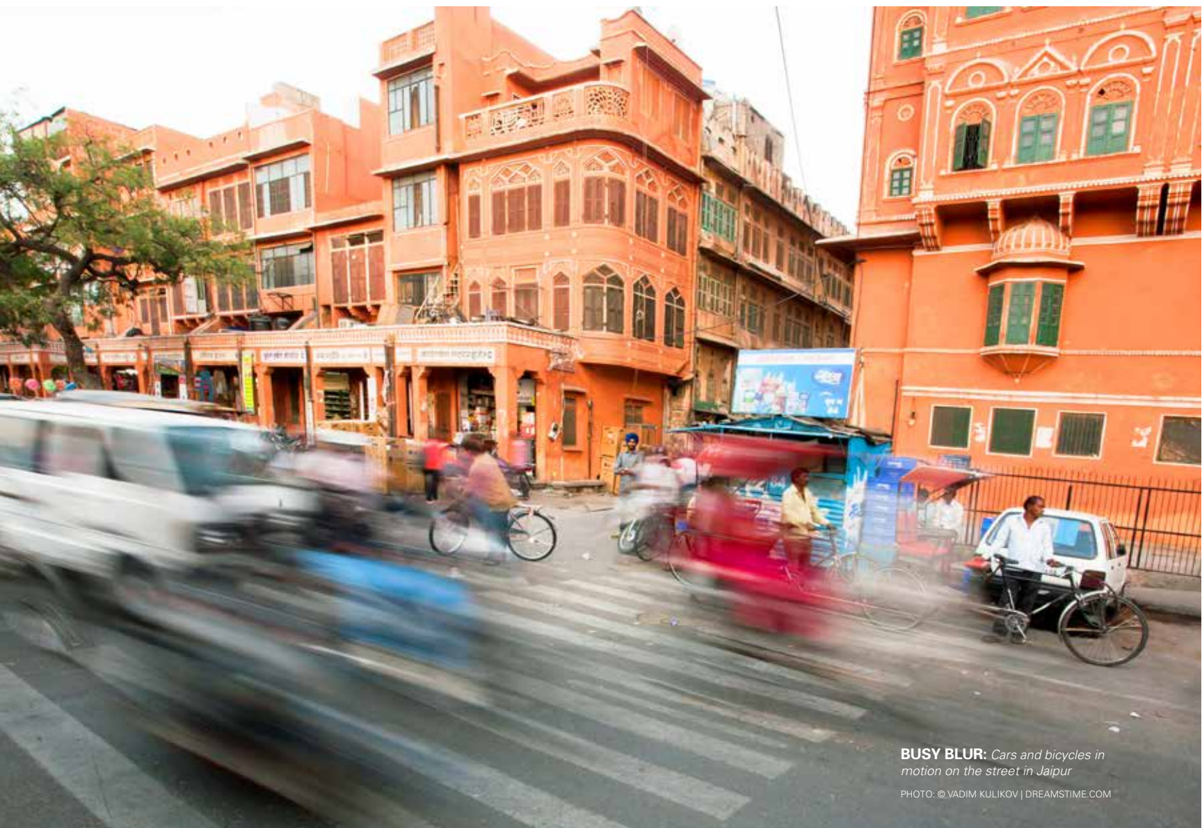
BUSY BLUR: Cars and bicycles in motion on the street in Jaipur